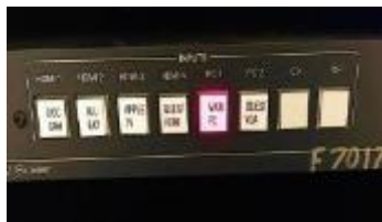
(This panel replaces the AMX system)