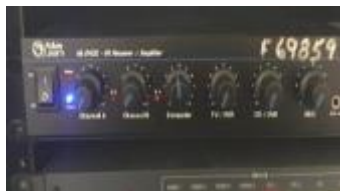
(NOTE: first 2 knobs should always be set to zero to avoid static noise)